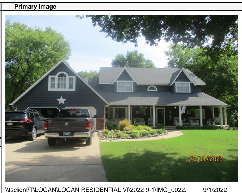
\\tsclient\T\LOGAN\LOGAN RESIDENTIAL VI\2022-9-1\IMG_0022. 9/1/2022