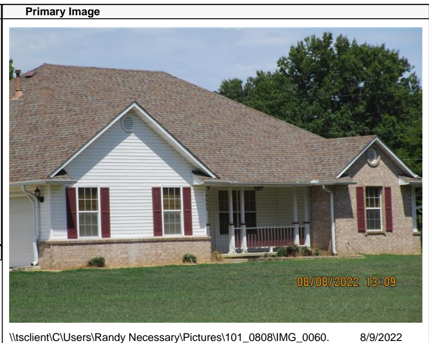
\\tsclient\C\Users\Randy Necessary\Pictures\101_0808\IMG_0060. 8/9/2022