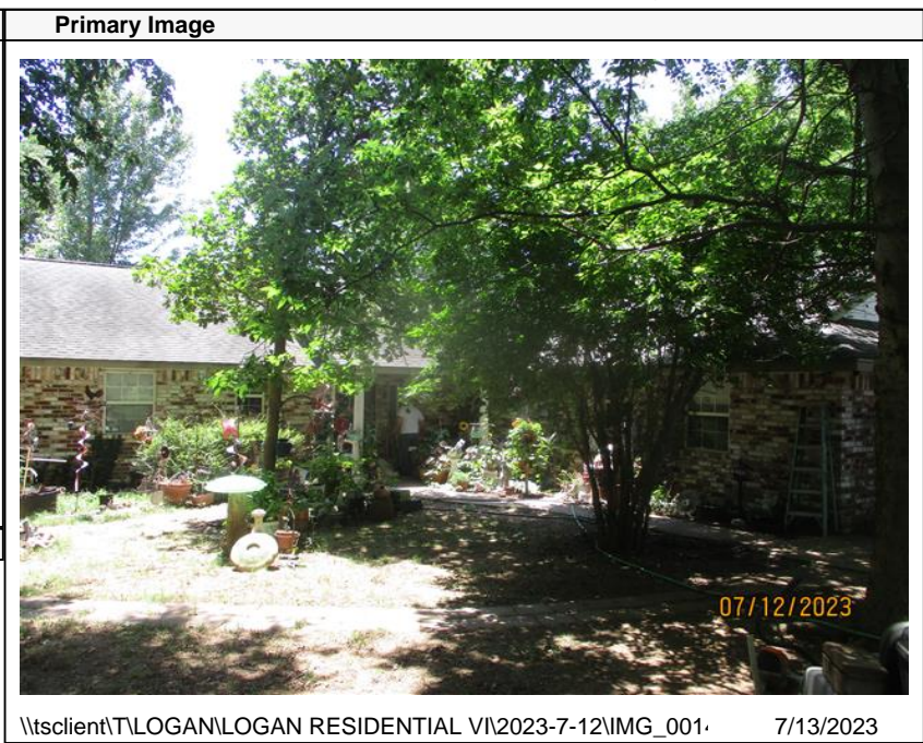
\\tsclient\T\LOGAN\LOGAN RESIDENTIAL VI\2023-7-12\IMG_001 7/13/2023