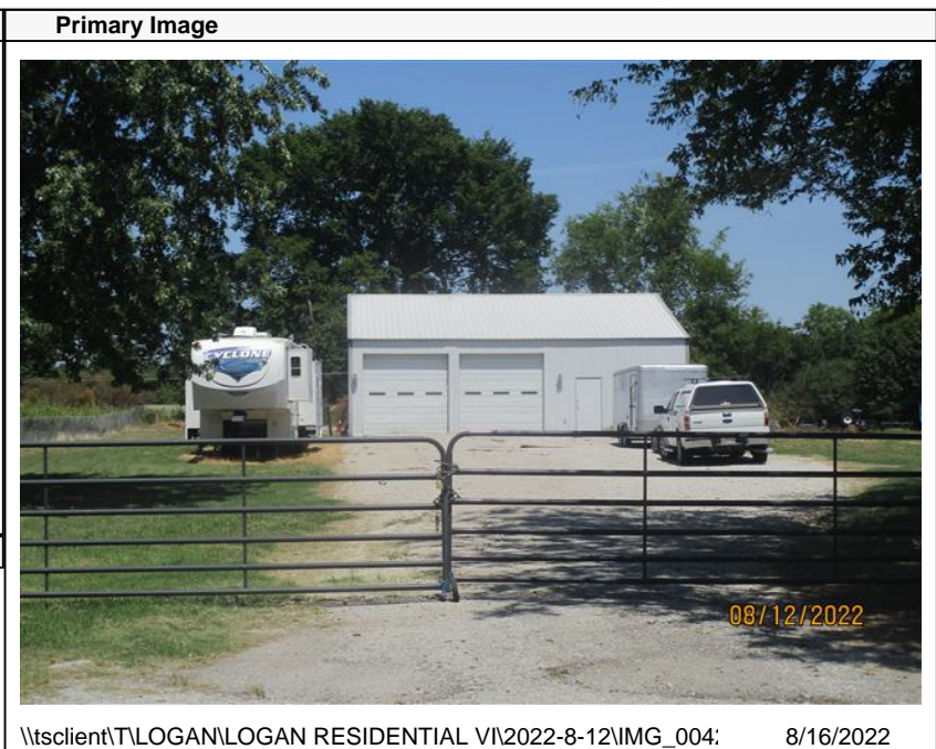
\\tsclient\T\LOGAN\LOGAN RESIDENTIAL VI\2022-8-12\IMG_004; 8/16/2022