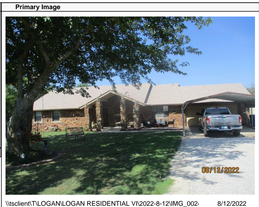
\\tsclient\T\LOGAN\LOGAN RESIDENTIAL VI\2022-8-12\IMG_002 8/12/2022