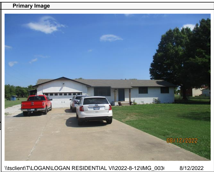
\\tsclient\T\LOGAN\LOGAN RESIDENTIAL VI\2022-8-12\IMG_003I 8/12/2022