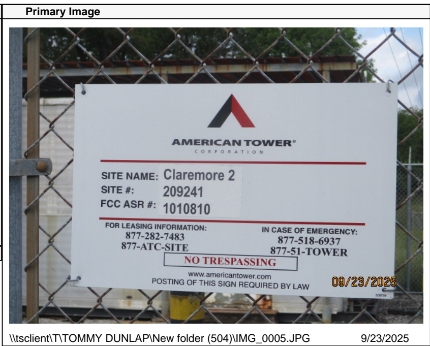
\\tsclient\T\TOMMY DUNLAP\New folder (504)\IMG_0005.JPG 9/23/2025