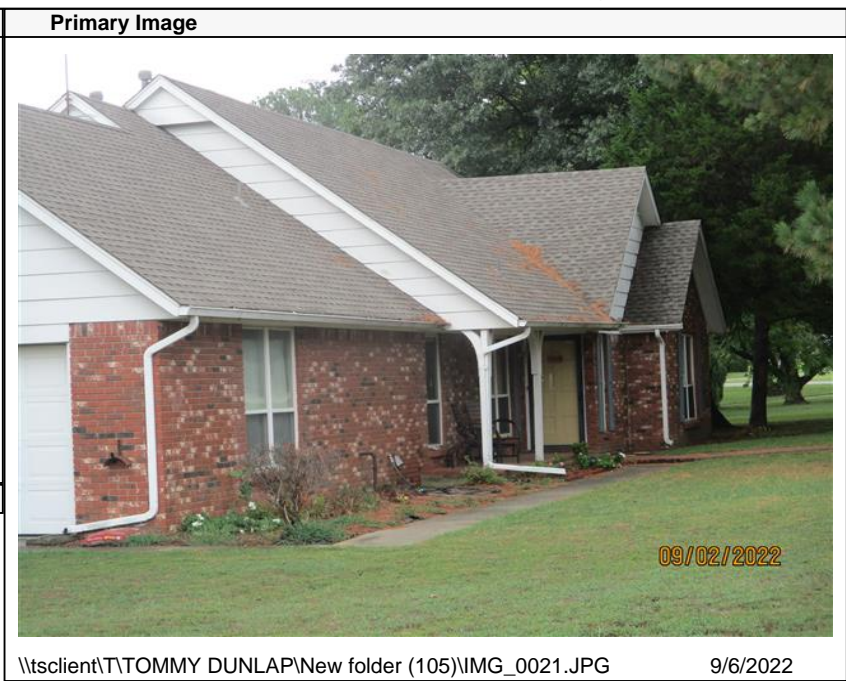
\\tsclient\T\TOMMY DUNLAP\New folder (105)\IMG_0021.JPG 9/6/2022