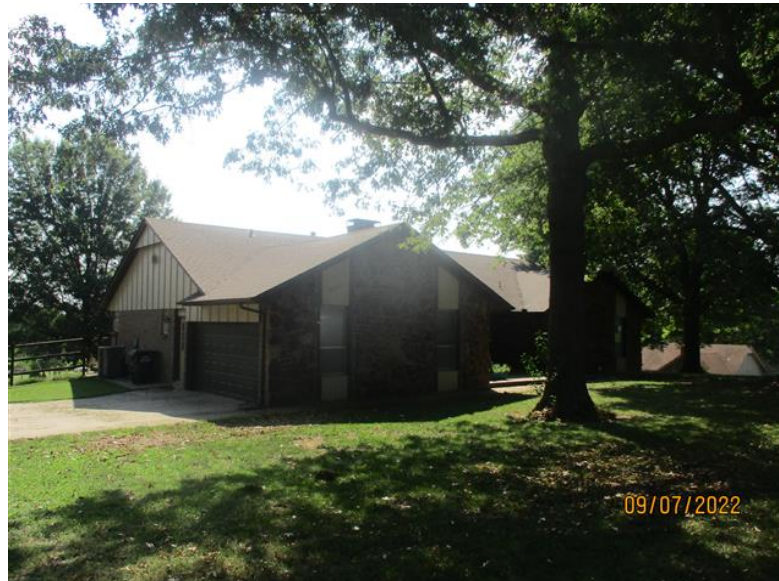
\\tsclient\T\LOGAN\LOGAN RESIDENTIAL VI\2202-9-7\IMG_0012. 9/7/2022

Situs 09621 N 151ST E AVE Subdivision SHERRI-LAVERNE ESTS Lot/Block 0006 / 0004 Parcel Size 1 - Lots Sec/Twn/Rng 15 / 21 / 14 / 5 Neighborhood 1069 - R-V04-SW OWASSO School District S021 - OWASSO SCHOOLS