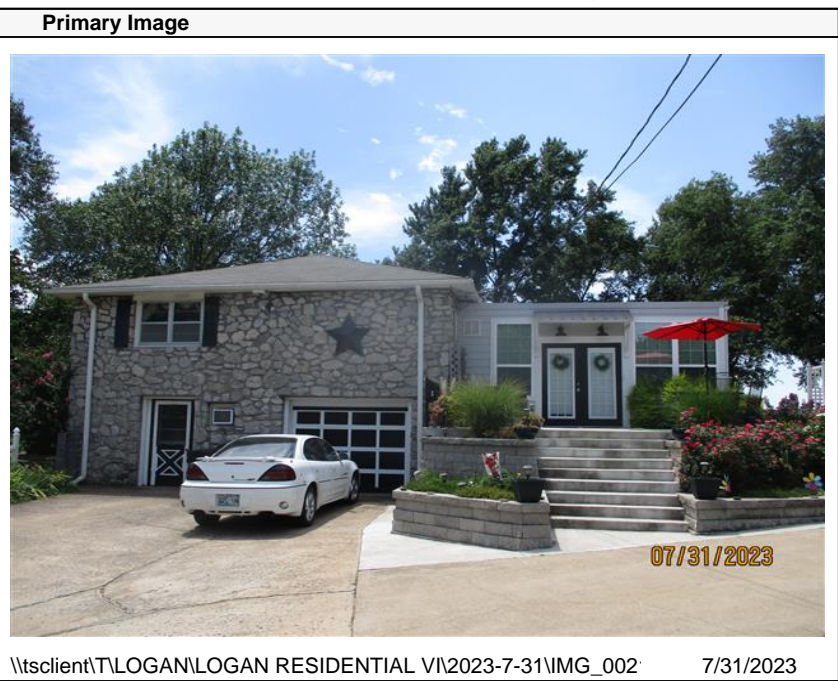
\\tsclient\T\LOGAN\LOGAN RESIDENTIAL VI\2023-7-31\IMG_002 7/31/2023