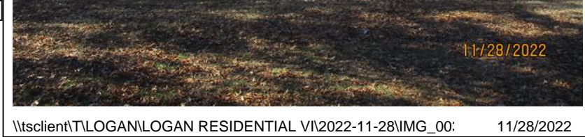
\\tsclient\T\LOGAN\LOGAN RESIDENTIAL VI\2022-11-28\IMG_00: 11/28/2022