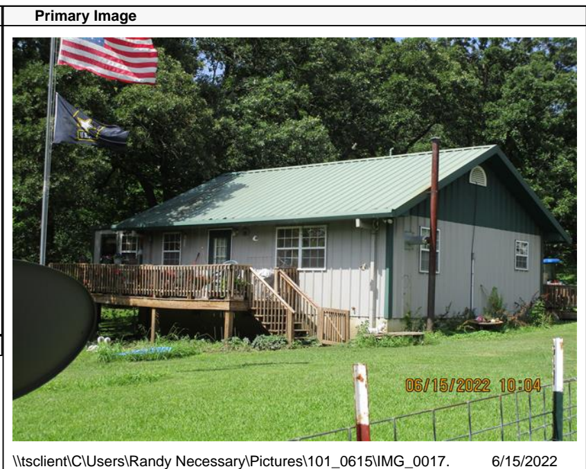
\\tsclient\C\Users\Randy Necessary\Pictures\101_0615\IMG_0017. 6/15/2022