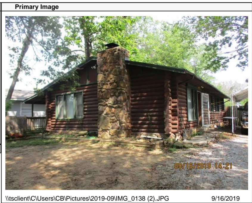
\\tsclient\C\Users\CB\Pictures\2019-09\IMG_0138 (2).JPG 9/16/2019