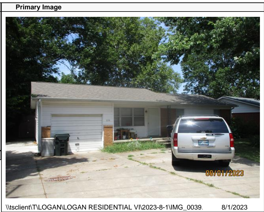
\\tsclient\T\LOGAN\LOGAN RESIDENTIAL VI\2023-8-1\IMG_0039. 8/1/2023