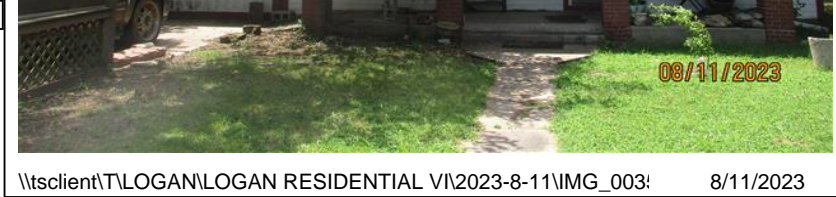
\\tsclient\T\LOGAN\LOGAN RESIDENTIAL VI\2023-8-11\IMG_003! 8/11/2023