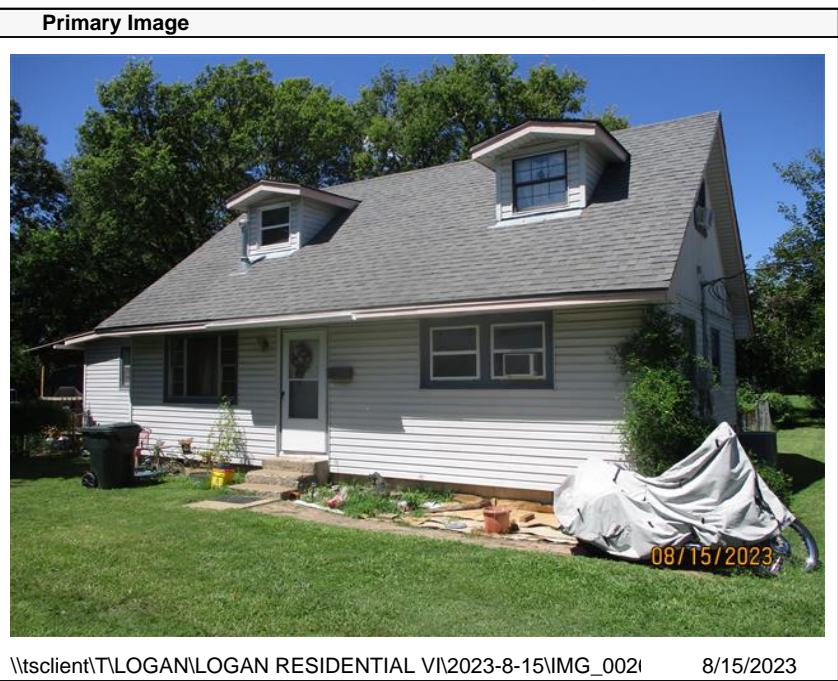
\\tsclient\T\LOGAN\LOGAN RESIDENTIAL VI\2023-8-15\IMG_002I 8/15/2023