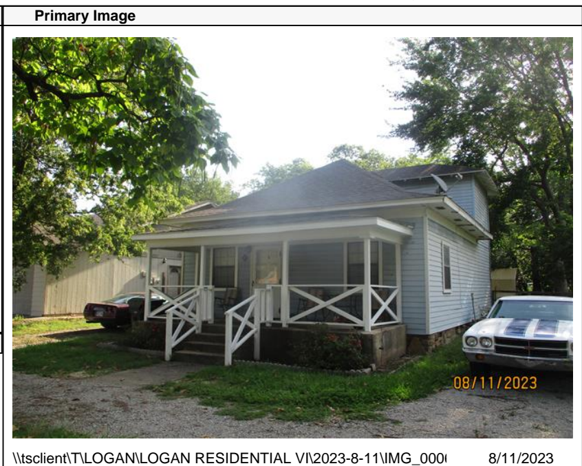
\\tsclient\T\LOGAN\LOGAN RESIDENTIAL VI\2023-8-11\IMG_0001 8/11/2023