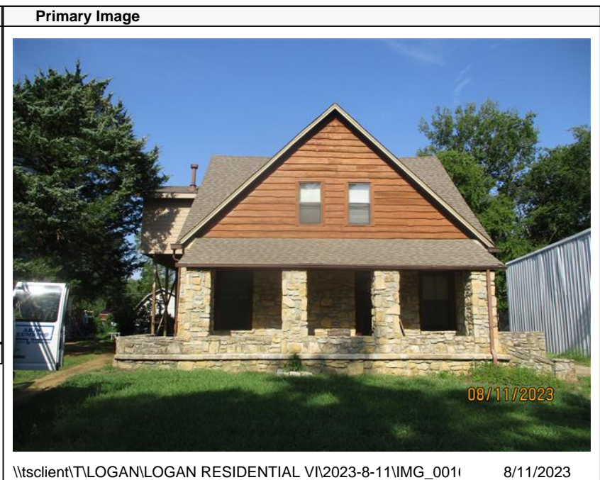
\\tsclient\T\LOGAN\LOGAN RESIDENTIAL VI\2023-8-11\IMG_001I 8/11/2023