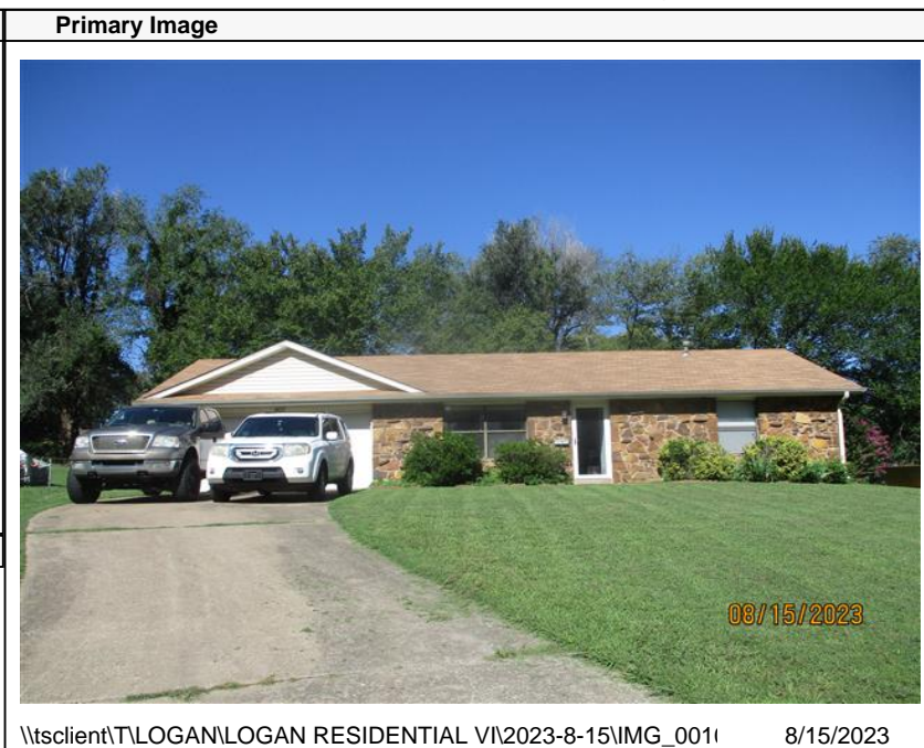
\\tsclient\T\LOGAN\LOGAN RESIDENTIAL VI\2023-8-15\IMG_001 8/15/2023