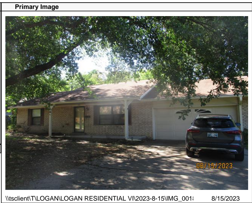
\\tsclient\T\LOGAN\LOGAN RESIDENTIAL VI\2023-8-15\IMG_001 8/15/2023