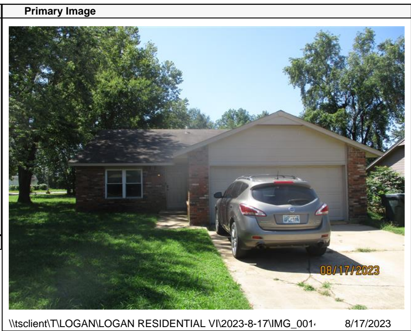
\\tsclient\T\LOGAN\LOGAN RESIDENTIAL VI\2023-8-17\IMG_001 8/17/2023