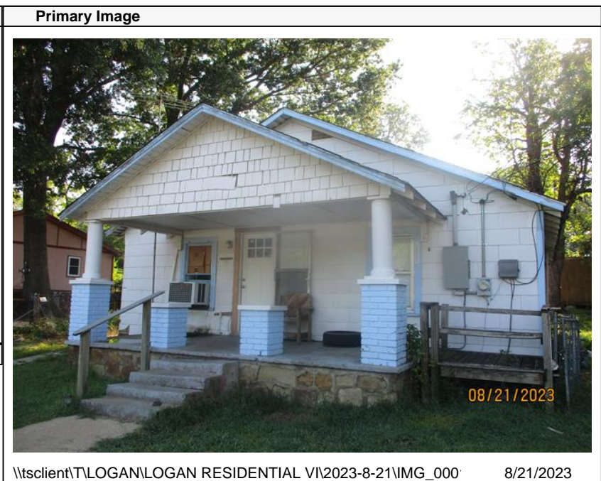
\\tsclient\T\LOGAN\LOGAN RESIDENTIAL VI\2023-8-21\IMG_000 8/21/2023