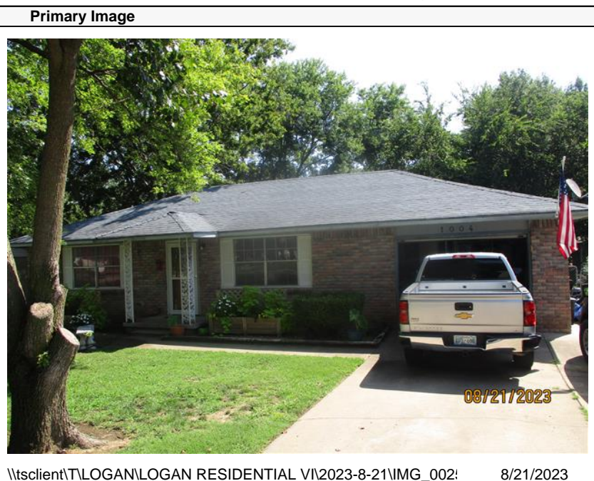
\\tsclient\T\LOGAN\LOGAN RESIDENTIAL VI\2023-8-21\IMG_002! 8/21/2023