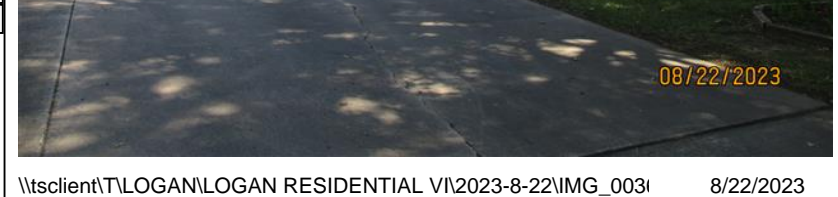
\\tsclient\T\LOGAN\LOGAN RESIDENTIAL VI\2023-8-22\IMG_003I 8/22/2023