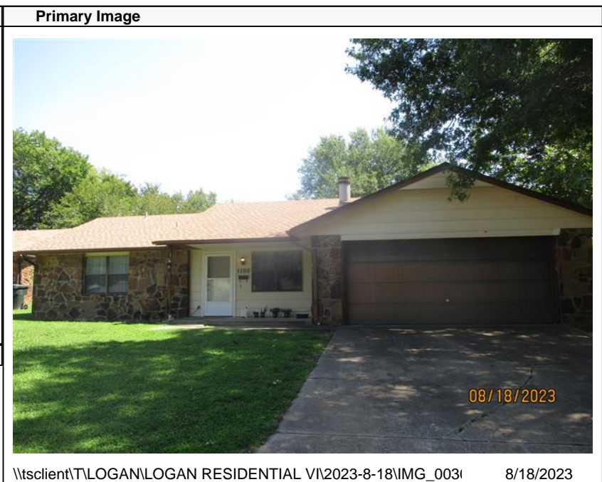
\\tsclient\T\LOGAN\LOGAN RESIDENTIAL VI\2023-8-18\IMG_003I 8/18/2023