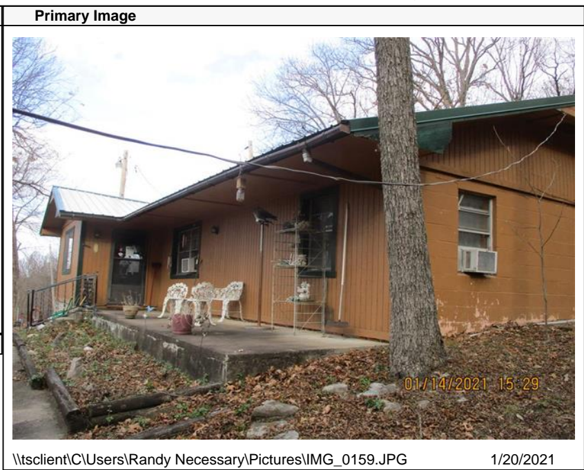
\\tsclient\C\Users\Randy Necessary\Pictures\IMG_0159.JPG 1/20/2021