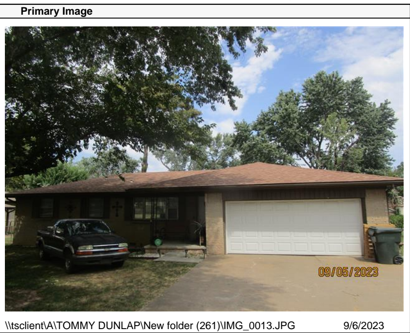
\\tsclient\A\TOMMY DUNLAP\New folder (261)\IMG_0013.JPG 9/6/2023