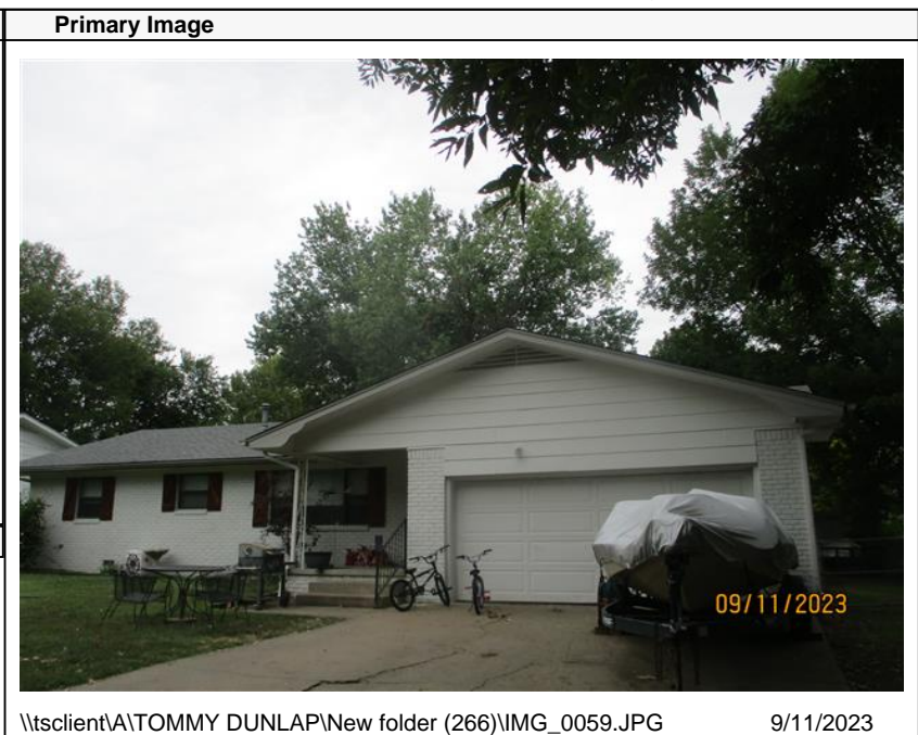
\\tsclient\A\TOMMY DUNLAP\New folder (266)\IMG_0059.JPG 9/11/2023