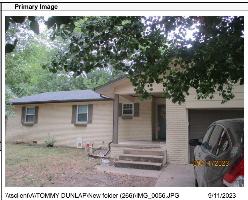
\\tsclient\A\TOMMY DUNLAP\New folder (266)\IMG_0056.JPG 9/11/2023