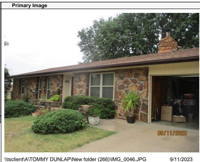
\\tsclient\A\TOMMY DUNLAP\New folder (266)\IMG_0046.JPG 9/11/2023