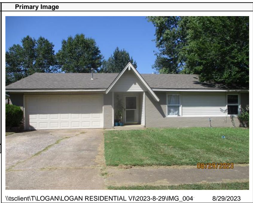
\\tsclient\T\LOGAN\LOGAN RESIDENTIAL VI\2023-8-29\IMG_004 8/29/2023