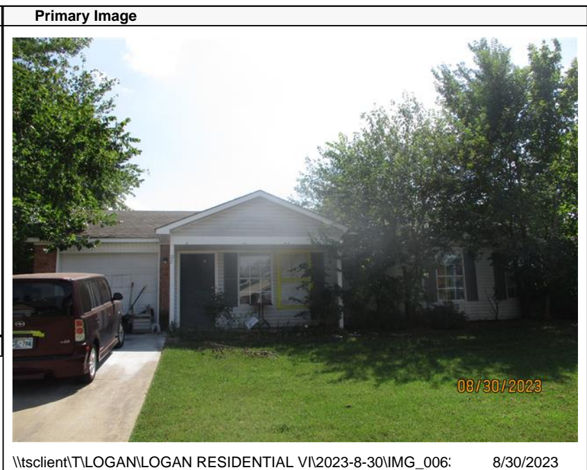
\\tsclient\T\LOGAN\LOGAN RESIDENTIAL VI\2023-8-30\IMG_006: 8/30/2023