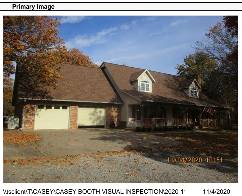
\\tsclient\TCASEY\CASEY BOOTH VISUAL INSPECTION\2020-1\ 11/4/2020