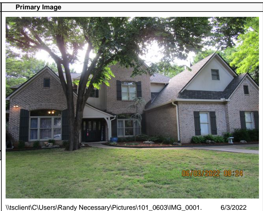
\\tsclient\C\Users\Randy Necessary\Pictures\101_0603\IMG_0001. 6/3/2022