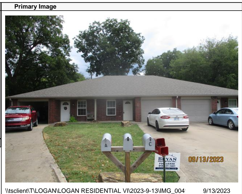
\\tsclient\T\LOGAN\LOGAN RESIDENTIAL VI\2023-9-13\IMG_004 9/13/2023