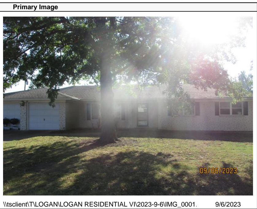
\\tsclient\T\LOGAN\LOGAN RESIDENTIAL VI\2023-9-6\IMG_0001. 9/6/2023