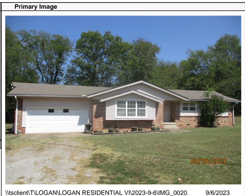
\\tsclient\TLOGAN\LOGAN RESIDENTIAL VI\2023-9-6\IMG_0020. 9/6/2023