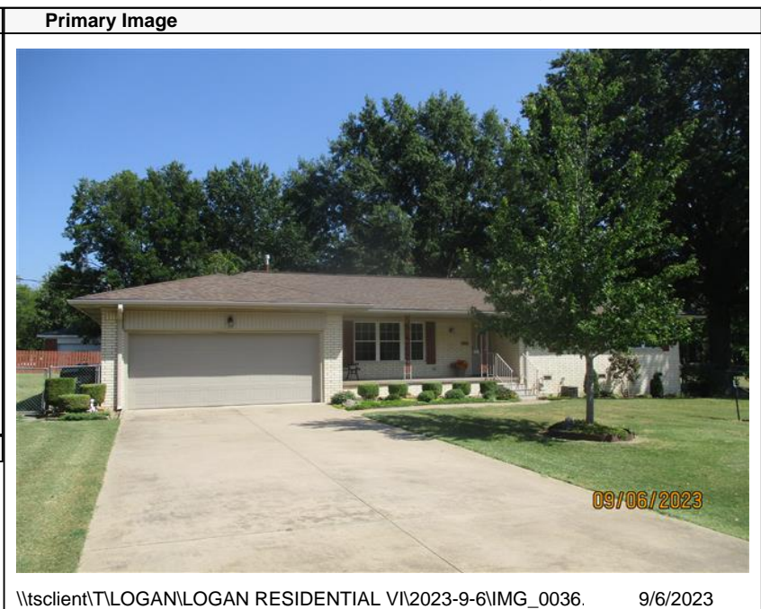
\\tsclient\T\LOGAN\LOGAN RESIDENTIAL VI\2023-9-6\IMG_0036. 9/6/2023