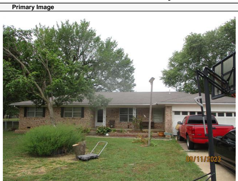
\\tsclient\T\LOGAN\LOGAN RESIDENTIAL VI\2023-9-11\IMG_0001 9/11/2023