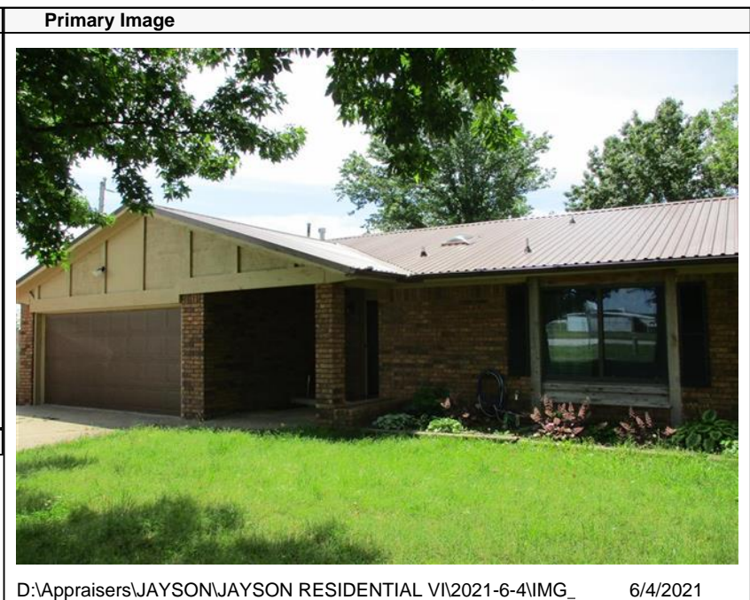
D:\Appraisers\JAYSON\JAYSON RESIDENTIAL VI\2021-6-4\IMG_ 6/4/2021