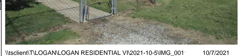
\\tsclient\T\LOGAN\LOGAN RESIDENTIAL VI\2021-10-5\IMG_001 10/7/2021