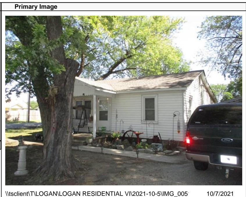
\\tsclient\T\LOGAN\LOGAN RESIDENTIAL VI\2021-10-5\IMG_005 10/7/2021