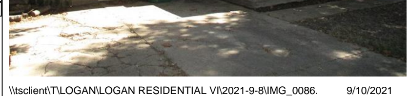
\\tsclient\T\LOGAN\LOGAN RESIDENTIAL VI\2021-9-8\IMG_0086. 9/10/2021