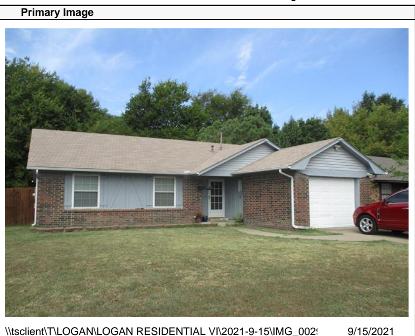
\\tsclient\T\LOGAN\LOGAN RESIDENTIAL VI\2021-9-15\IMG_002! 9/15/2021