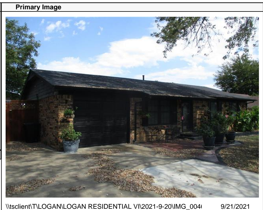
\\tsclient\T\LOGAN\LOGAN RESIDENTIAL VI\2021-9-20\IMG_004I 9/21/2021