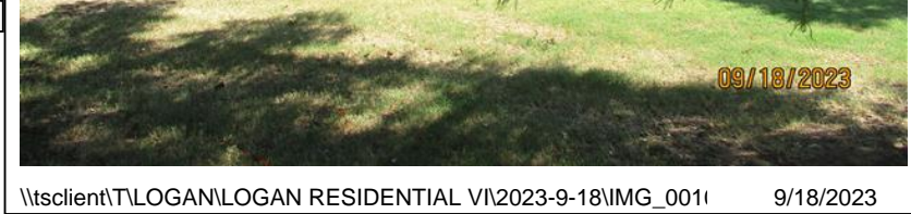
\\tsclient\T\LOGAN\LOGAN RESIDENTIAL VI\2023-9-18\IMG_001 9/18/2023