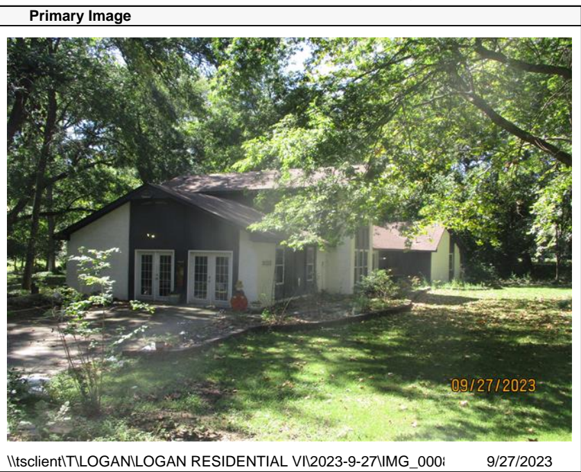
\\tsclient\T\LOGAN\LOGAN RESIDENTIAL VI\2023-9-27\IMG_0001 9/27/2023