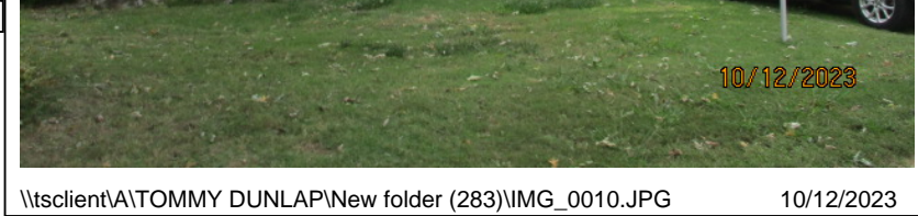
\\tsclient\A\TOMMY DUNLAP\New folder (283)\IMG_0010.JPG 10/12/2023