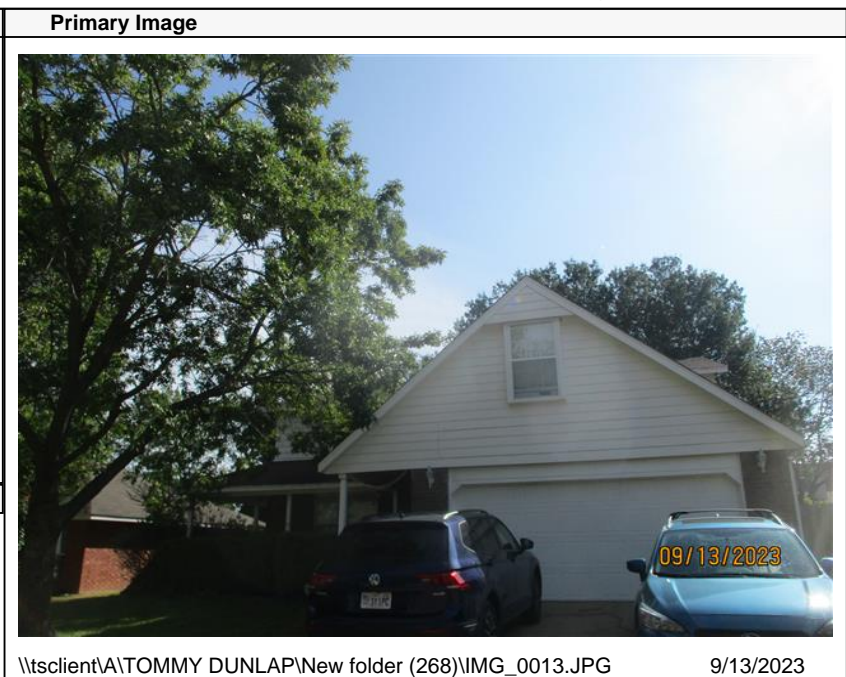
\\tsclient\A\TOMMY DUNLAP\New folder (268)\IMG_0013.JPG 9/13/2023