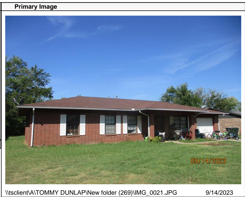
\\tsclient\A\TOMMY DUNLAP\New folder (269)\IMG_0021.JPG 9/14/2023